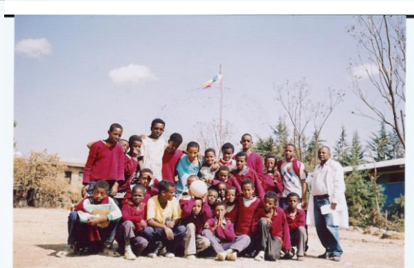
This was in 2001