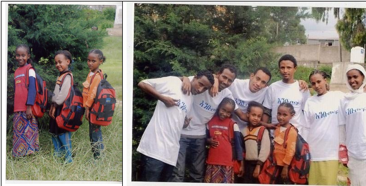
The 3 new school girls, sponsored by the CAB for their school supply ...