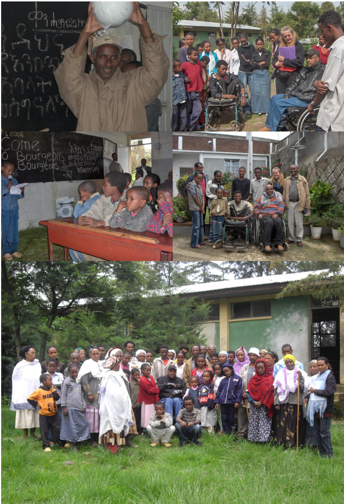
This was in 2006 and 2009 (with the parents of the students)