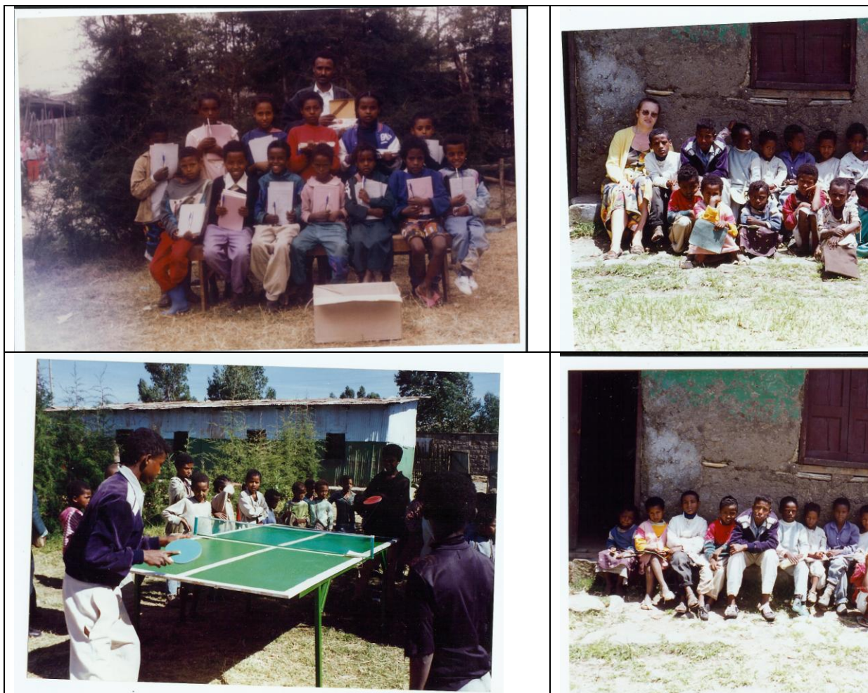
These pictures were taken in October 1994 (students with their 1 st entertainments) It is true that these pictures are old like our age, but the small children are now adult !!