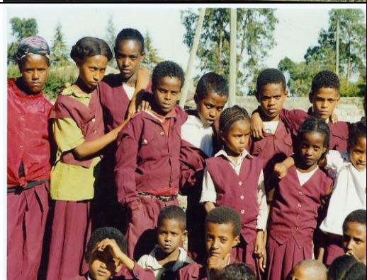
These pictures were taken in 1998