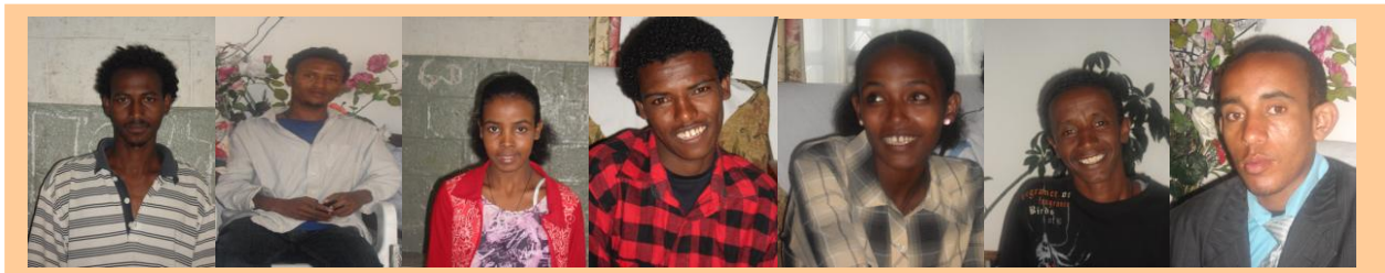
The board Office of the CAB