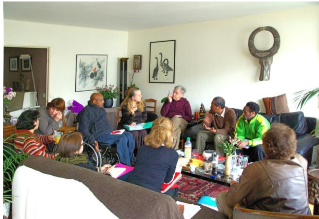
The office - (during the meeting)

Association BOURGEONS 27 rue André Tessier 94240 Fontenay sous bois France E-mail : bourgeons.nbout@wanadoo.fr Tel/Fax : 00 33 1 48 77 46 06